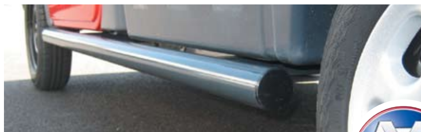
Side impact bars