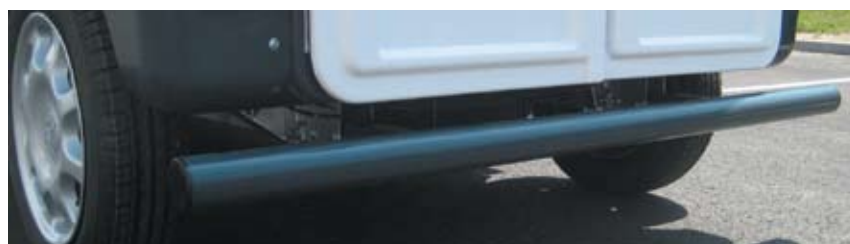
Rear impact bar