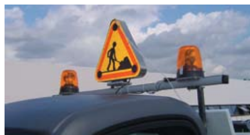
Roadsign bar (with 2 beacon lights)