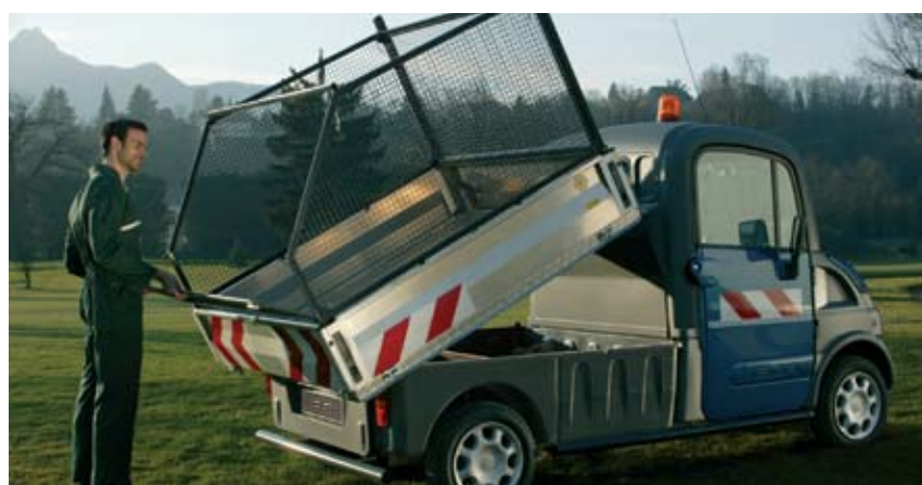
Cage / Side and rear impact bars / Beacon light